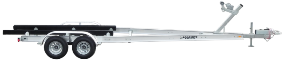
Image of Model #5S-AC26T8400102LTB2. Options and features may differ.